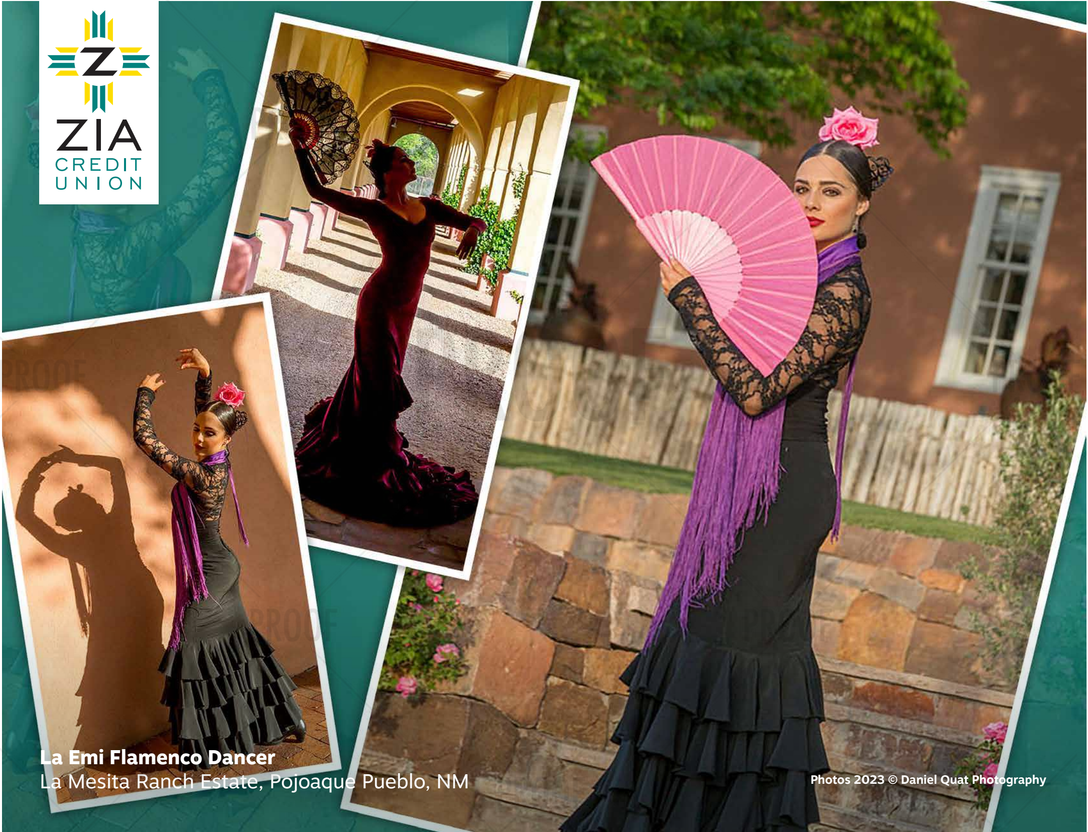
La Emi Flamenco Dancer La Mesita Ranch Estate, Pojoaque Pueblo, NM