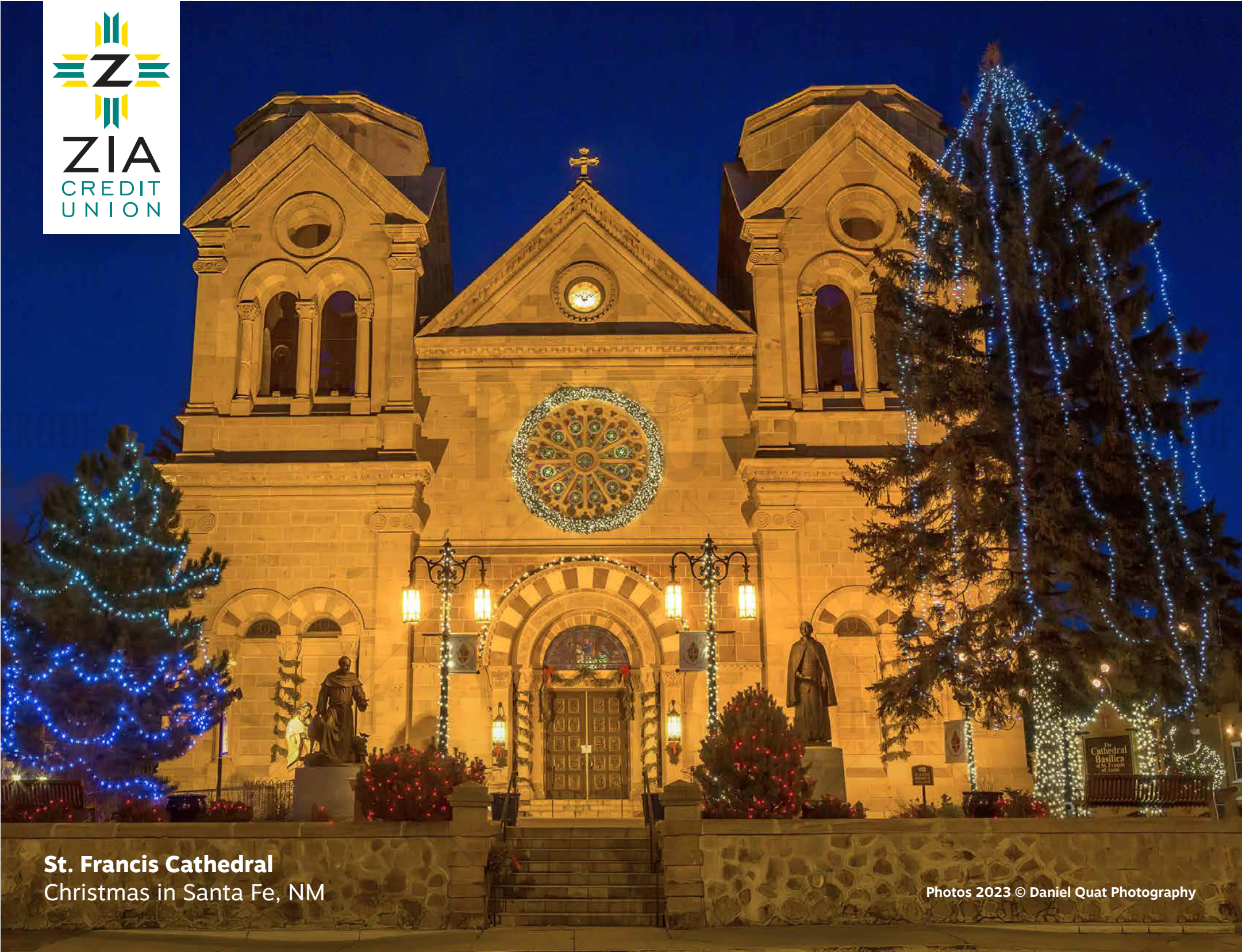
St. Francis Cathedral Christmas in Santa Fe, NM