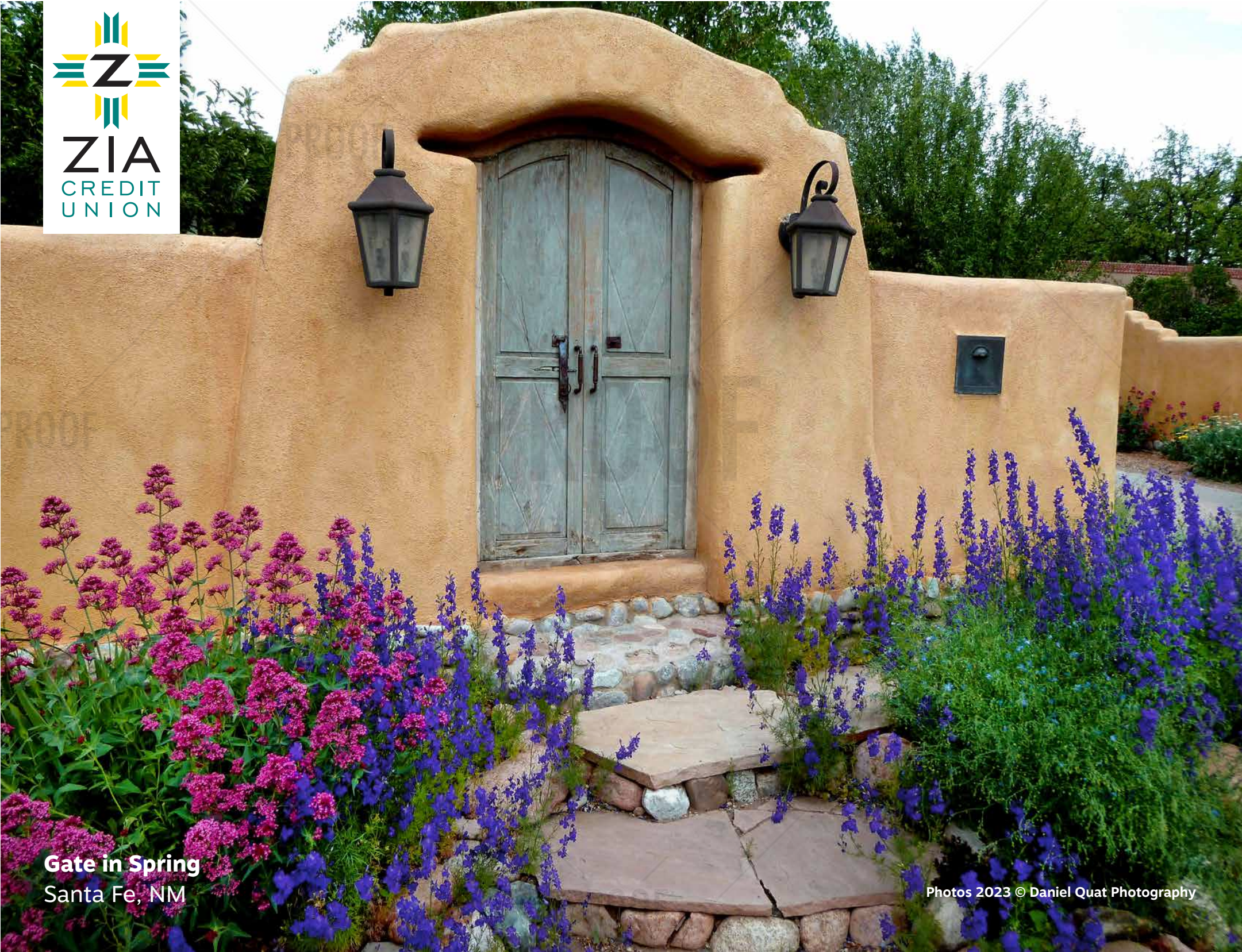
Gate in Spring Santa Fe, NM