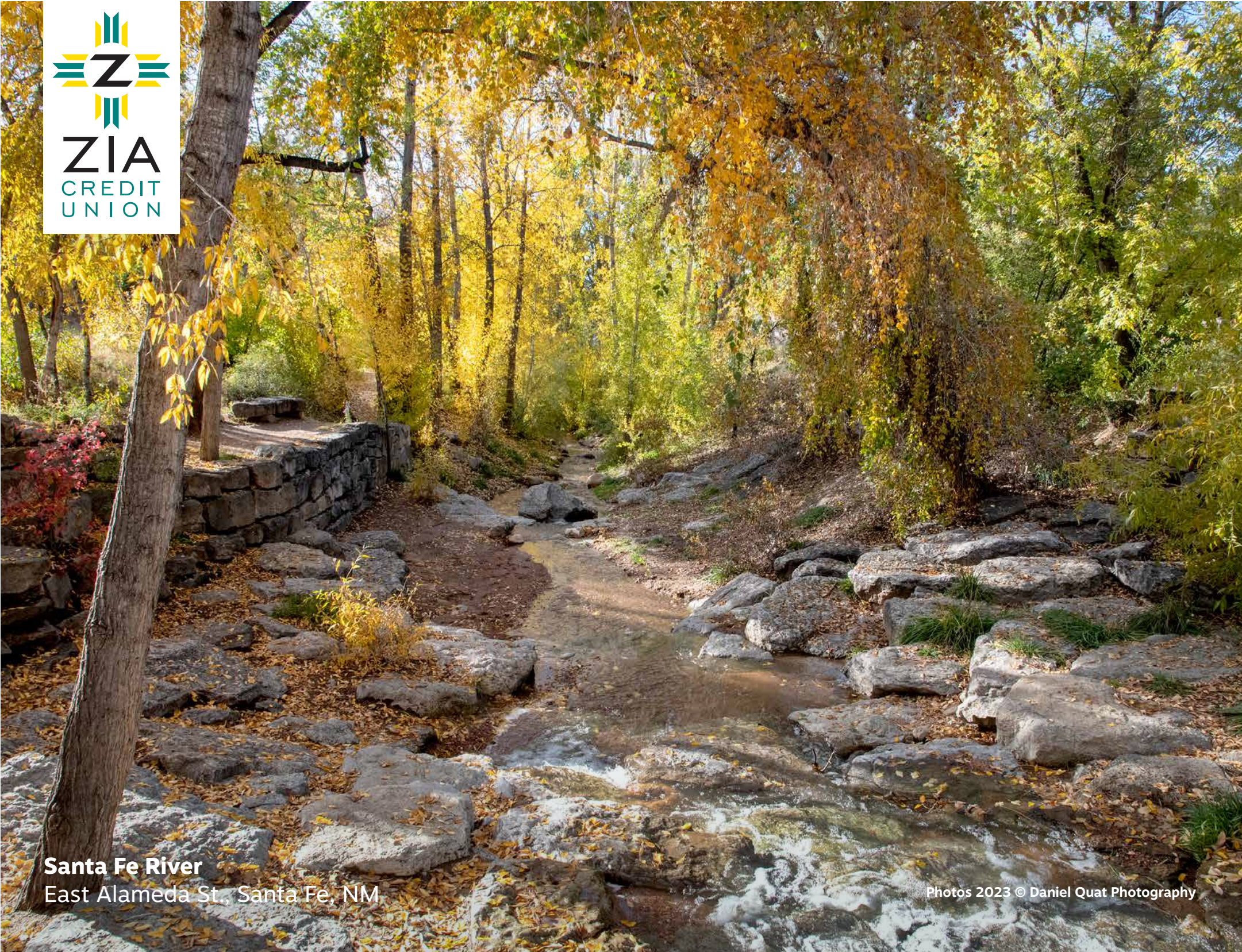
Santa Fe River East Alameda St., Santa Fe, NM