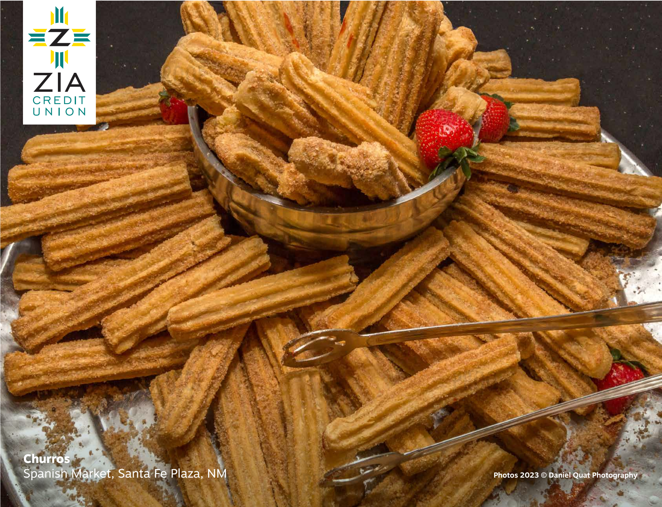
Churros Spanish Market, Santa Fe Plaza, NM