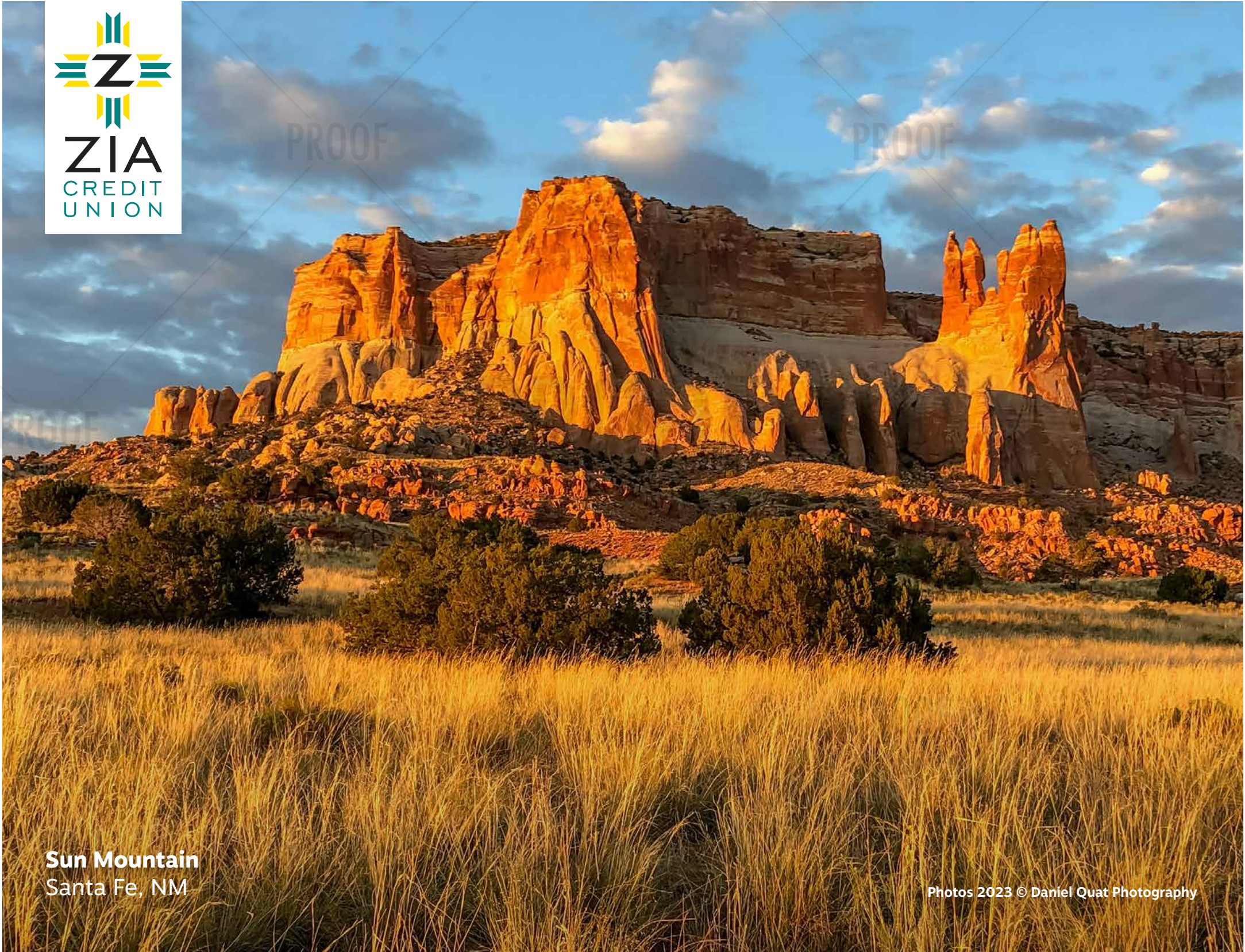
Sun Mountain Santa Fe, NM