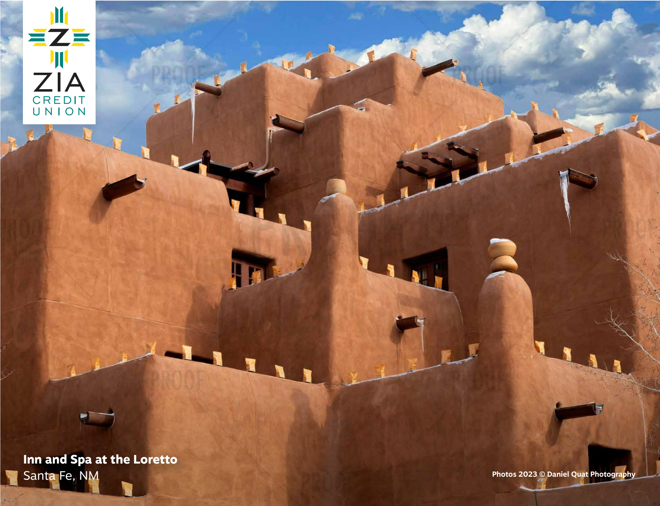
Inn and Spa at the Loretto Santa Fe, NM